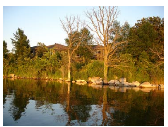
Trees not only provide beauty and shade for relief on hot summer days; they are also very beneficial along lakeshore. They are important for maintaining water quality and healthy habitat in our lakes.

Before humans settled northern Minnesota, many of the lakes had trees along the shoreline. When we started building cabins and houses, we removed many of the trees and replaced the area with manicured lawns. Many of the new seedlings under existing trees get mowed over now, and many of our mature trees are dying due to age or disease. In the next few decades, if the mature trees are gone, there will be no young trees to replace them.